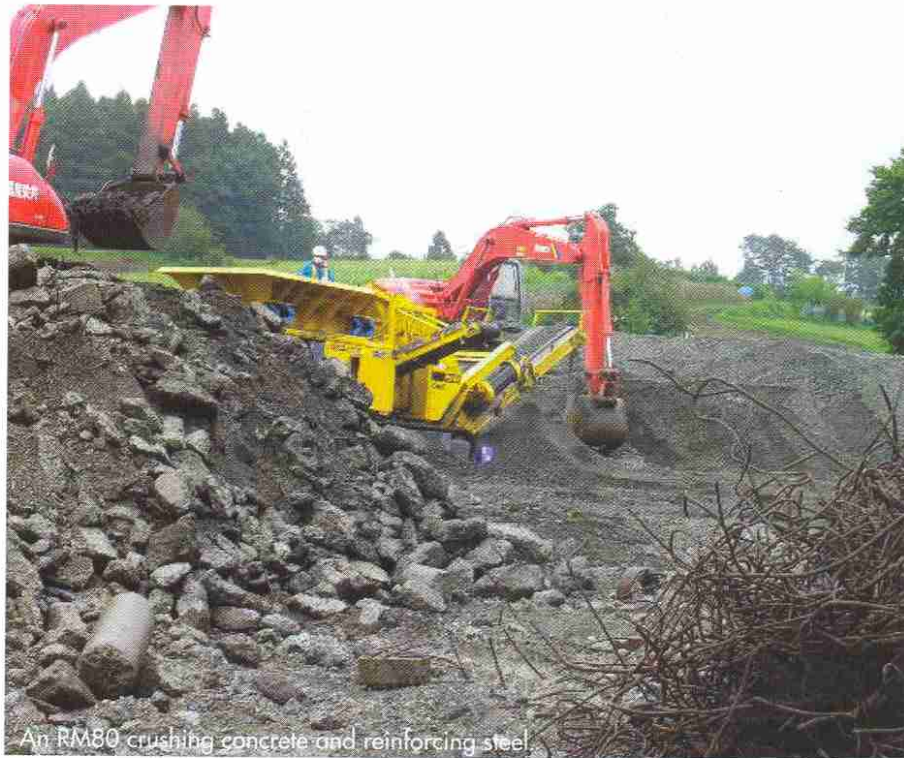
An RM80 crushing concrete and reinforcing steel

Optimised feeding and, depending on the application, hydraulically adjustable parameters for the crushing and impact plate geometry, plus a remote controlled release system (supplied as standard) on all Rubble Master machines ensure impressively high throughput.