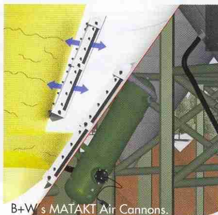
B+W's MATAKT Air Cannons.

zles, the RESORB odour absorber is sprayed onto the source, eliminating any unpleasant odours from the environment.