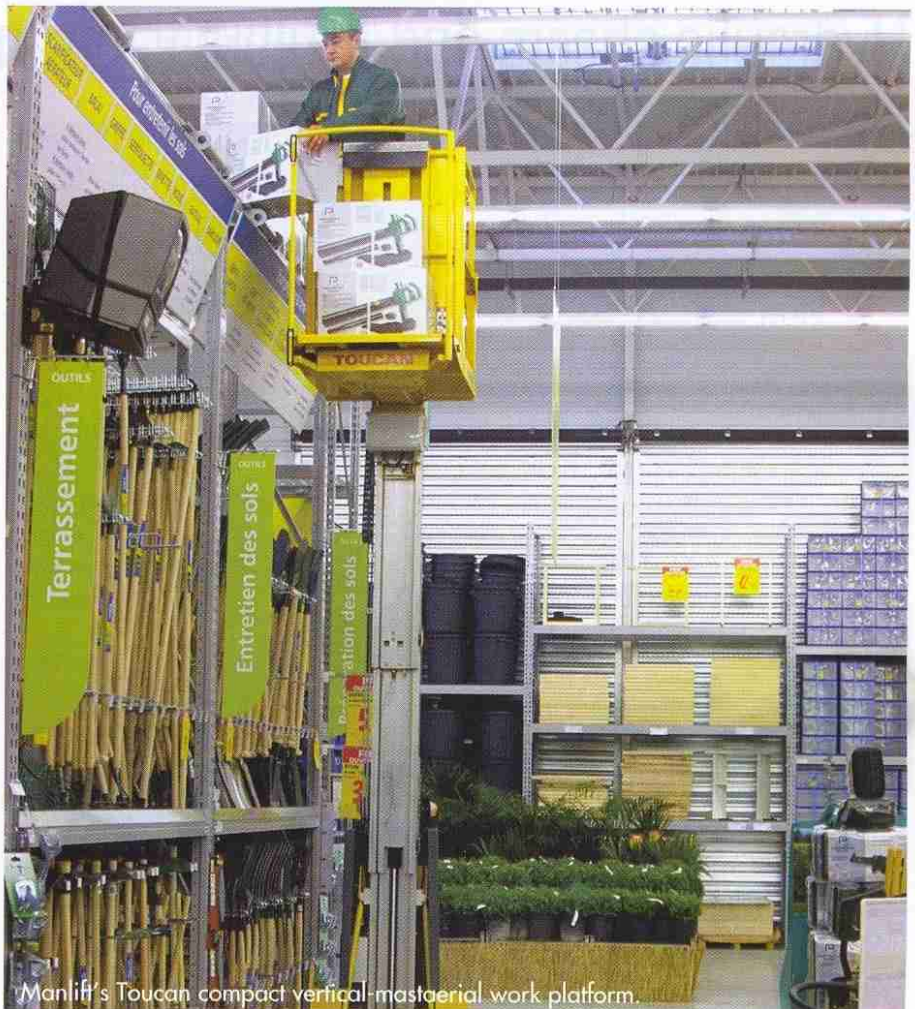
Manlift's Toucan compact vertical-mast aerial work platform.